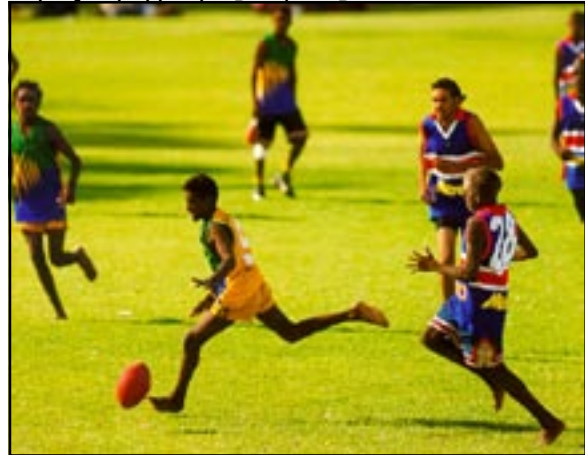
Above: Aussie Rules Football - one of the many sports played at Traeger Park.

other Councils. Preliminary design commenced for redevelopment of Stuart Terrace as the next project