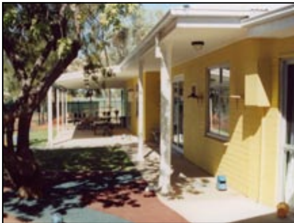
The redeveloped Braitling Child Care Centre

Upgrading and repair works were completed costing approximately $750,000.