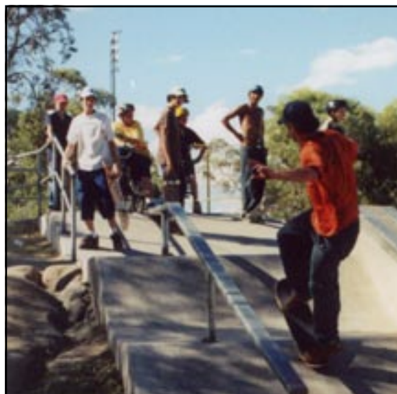
Best recreation facility - Alice Springs Skate Park

• Agreement with the NT Government to fund a new position of Sport and Recreation Officer. The Sports Faculties Advisory Committee obtained NT Government funding of $130,000 over three years through planning and coordination with sporting groups. The Sport and Recreation Officer has enabled a higher level of consultation with community sports groups, which has been acknowledged. The Officer