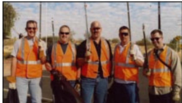
Adopt-a-street volunteers - Detachment 421

in consultation with the Waste Management Advisory Committee.