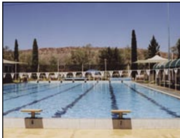
Alice Springs Swimming Centre: a Council facility, managed by the YMCA

• The maintenance of parks and reserves included