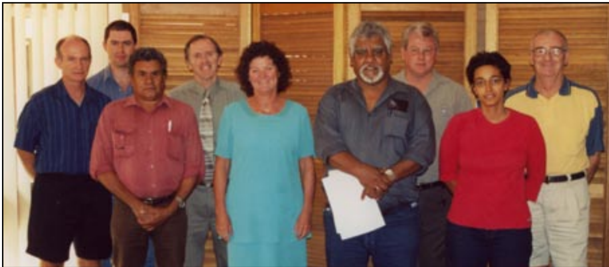
Alice Springs Town Council worked with Tangentyere Council under a Memorandum of Understanding

The principal supporting objectives and outcomes were: