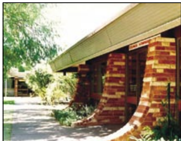
Civic Centre - cnr Todd St and Gregory Tce

The Council received approximately $470,000 in Roads to Recovery grants, which were expended on the redevelopment of Leichhardt Terrace. The program was accelerated to achieve completion of the whole project, and this resulted in future grants being received sooner because of the slow take up by some