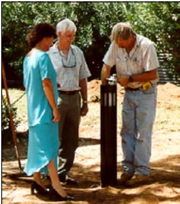
Installation of security lighting in Todd Mall