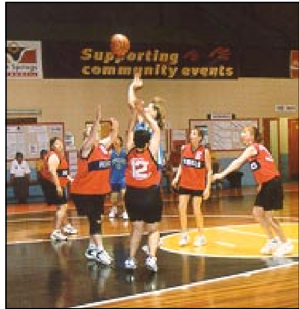
2002 Masters Games - financial and in-kind support

Knowledge and use of the Convention Center for