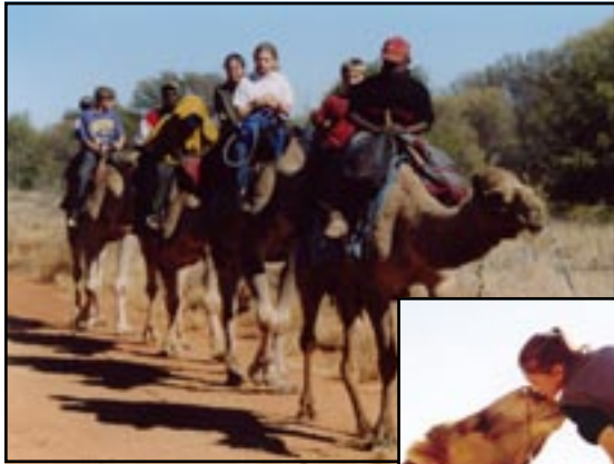
Bush Mob: A journey of discovery for Alice Springs youth