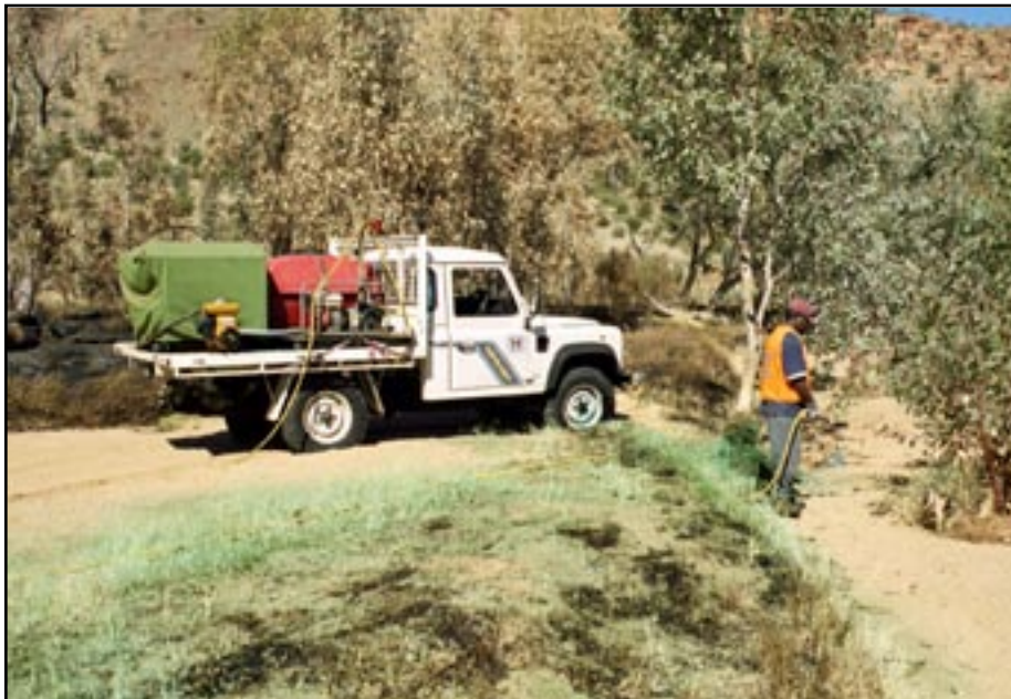
Left: Restoring the Todd River to its natural condition - spraying couch grass

Council to purchase quads specially equipped for spraying. Works for the removal of couch grass will continue.