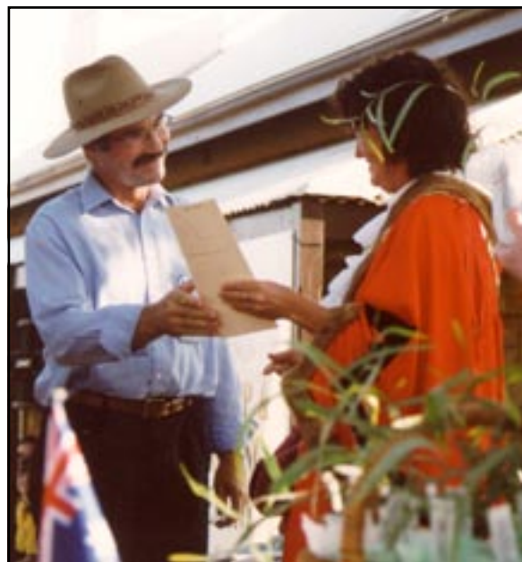
Australia Day Citizenship Ceremony at the Telegraph Station

Australia Day was celebrated at the Old Telegraph Station which was well attended. Regular individual citizenship ceremonies were conducted throughout the year, including Territory Day.