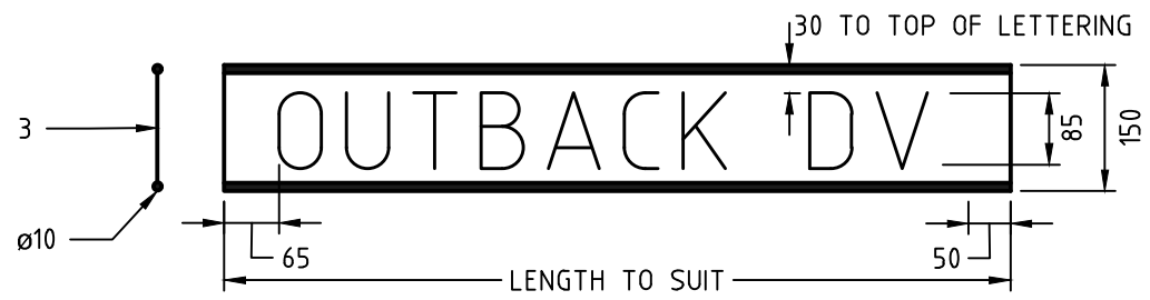
SIGN DETAILS NTS